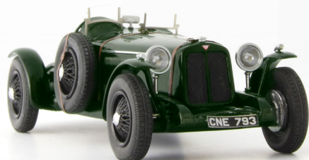
■ Alvis Speed 20 SA 4.3 Litre Special (GB, 1933) dark green autocult #02004 scale 1/43, 105mm