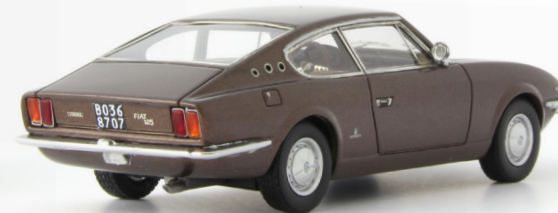
■ Vignale Fiat 125 Samantha (I, 1967) brown-metallic autocult #05005 scale 1/43, 103mm