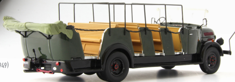
■ Steyr 380a Cabriobus (A, 1949) dark green autocult #10000 scale 1/43, 177mm