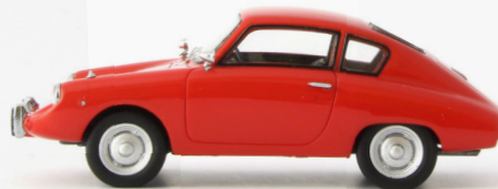
■ Jamos GT (A, 1962) red autocult #06010 scale 1/43, 79mm