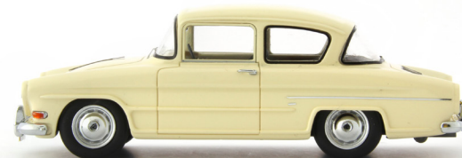
■ Zunder 1500 Porsche (ARG, 1960) ivory autocult #05007 scale 1/43, 101mm