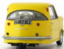
■ Shelter (NL, 1958) yellow autocult #03004 scale 1/43, 55mm