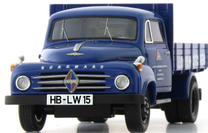
TRUCKS ■ Borgward B1500 Pritschenwagen (D, 1955) "Lloyd", blue autocult #11003 scale 1/43, 123mm