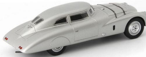
■ Adler Trumpf Rennlimousine (D, 1939) silver autocult #04005 scale 1/43, 100mm