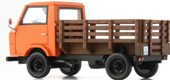
■ VW EA489 Basistransporter (D, 1973) orange/ brown autocult #08002 scale 1/43, 95mm