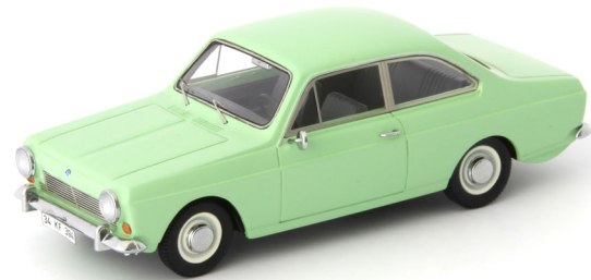
■ Anadol A1 (TUR, 1966) light green autocult #02006 scale 1/43, 104mm