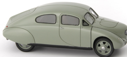
PROTOTYPES ■ Leichtbau Maier (D, 1935) grey autocult #06013 scale 1/43, 103mm