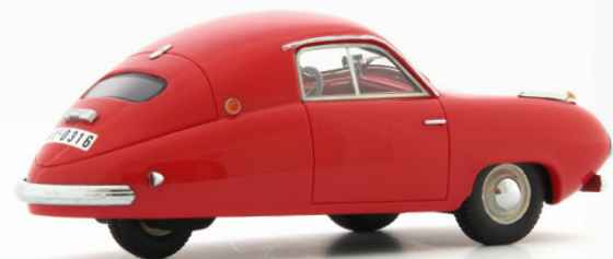
■ Ruhrfahrzeugbau Pinguin II (D, 1955) red autocult #06001 scale 1:43