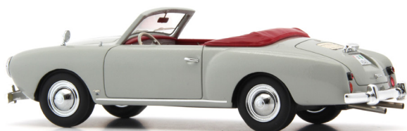
Beutler Spezial Cabriolet (CH, 1953) grey 106 mm (scale 1/43) autocult #05019