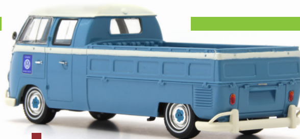
VW T1 Doppelkabine Langpritsche (D, 1961) light blue/ white 126 mm (scale 1/43) autocult #07008