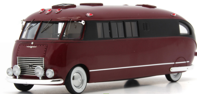
Johnson Wax House Car (USA, 1939) dark Red/ black 170 mm (scale 1/43) autocult #09005