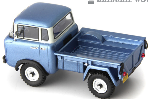
TRUCKS Willys FC-150 Pick-Up (USA, 1956) light blue 87 mm (scale 1/43) autocult #08009