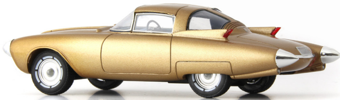
PROTOTYPES Oldsmobile Golden Rocket (USA, 1956) gold metallic 118 mm (scale 1/43) autocult #06020