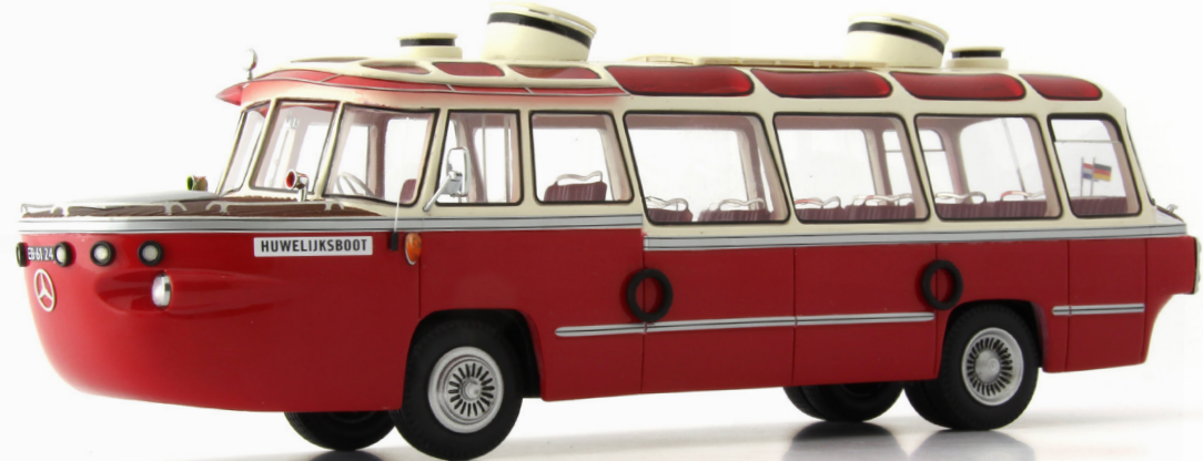
BUSES Mercedes-Benz OP312 van Rooijen (NL, 1958) red/ white 229 mm (scale 1/43) autocult #10002