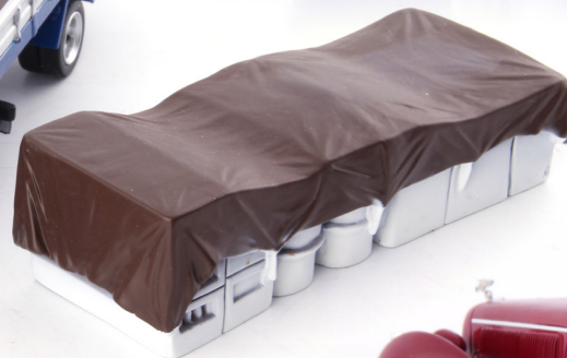
Amilcar G36 Pegase Grand Prix Roadster (F, 1935) dark red 106 mm (scale 1/43) autocult #02017