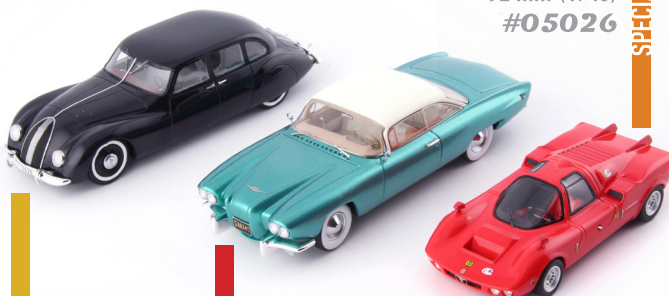
SPECIAL EDITIONS FNM Alfa Romeo Furia GT (BRA, 1971) red 92 mm (1/43) #05026