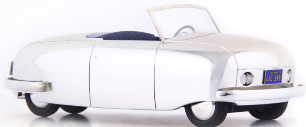
Hewson Rocket (USA, 1946) chromed 94 mm (scale 1/43) autocult #04019