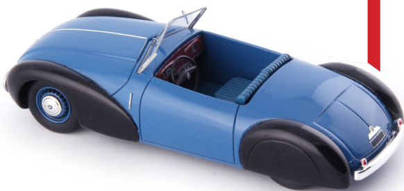
SPECIAL EDITION BMW 340/1 Roadster (D, 1949) blue/ black 98 mm (scale 1/43) autocult #06029