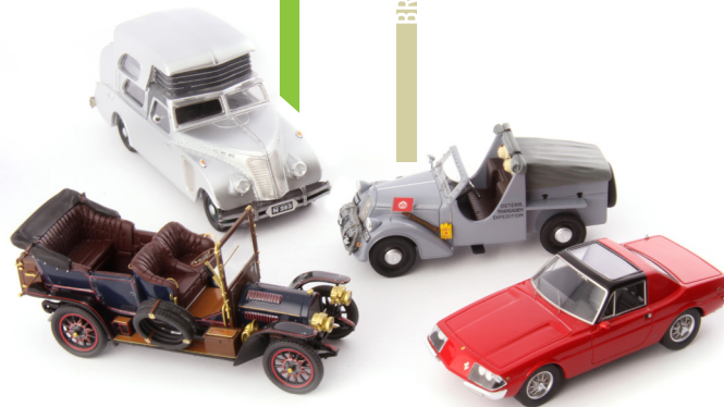
BRANDS OF THE PAST Steyr 100 "Asien-Steyr" (A, 1934) grey 100 mm (1/43) #02018

technical changes and errors excepted • printed in Germany • # 99905