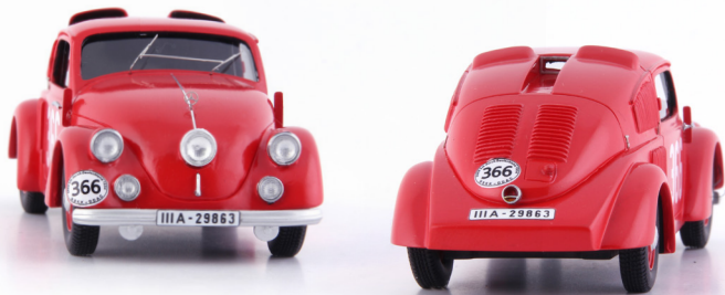
RAVING Mercedes-Benz 150H Sport-Limousine (D, 1934) red 98 mm (scale 1/43) autocult #07015