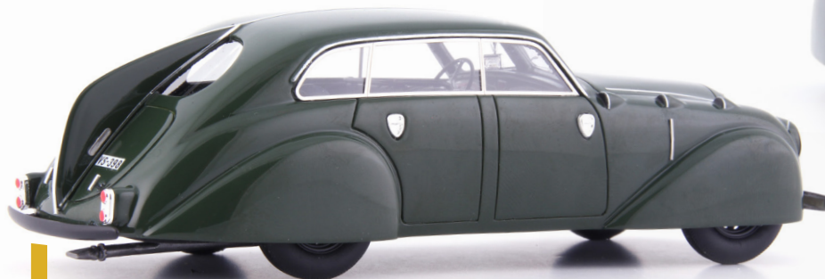
STREAMLINER Adler Diplomat Stromlinie Autenrieth (D, 1938) dark green 134 mm (scale 1/43) autocult #04021