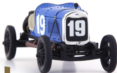
FAR BEGINNINGS Ford A (ARG, 1929) blue/ black #19 "Juan Manuel Fangio" 79 mm (scale 1/43) autocult #01008