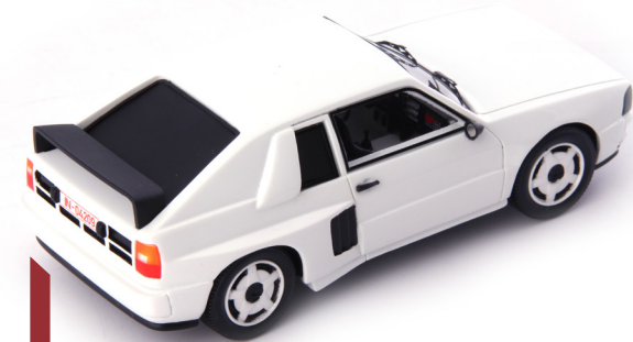
Audi Quattro Gr.B Mittelmotor-Prototyp (D, 1985) white 93 mm (scale 1/43) autocult #07013