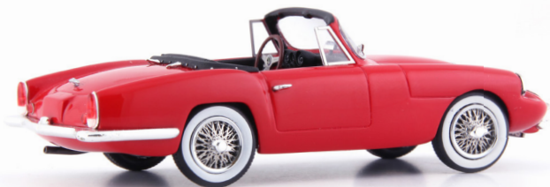
SPECIAL EDITIONS Sabra Sport Roadster (ISR, 1963) red 103 mm (scale 1/43) autocult #05027