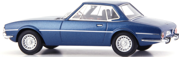
PROTOTYPES BMW 1600ti Coupé Paul Bracq (D, 1969) dark blue 97 mm (scale 1/43) autocult #06034