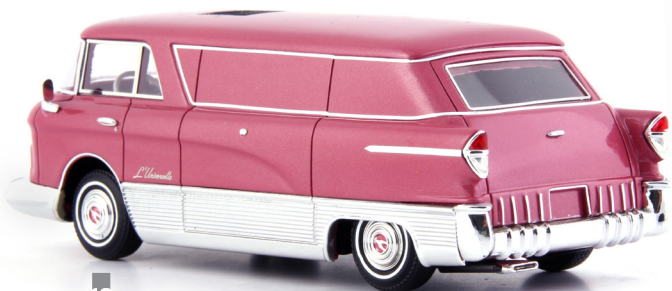
VEHICLES GMC L'Universelle (USA, 1955) red 117 mm (scale 1/43) autocult #08011