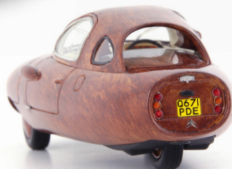
SMALL & MICRO CARS Citroen 2CV Wood Tryane II (GB/F, 1986) brown 96 mm (scale 1/43) autocult #03017