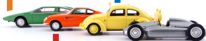
VW Käfer "Follow Me" Berlin-Tempelhof (D, 1954) yellow 100 mm (1/43) #12007