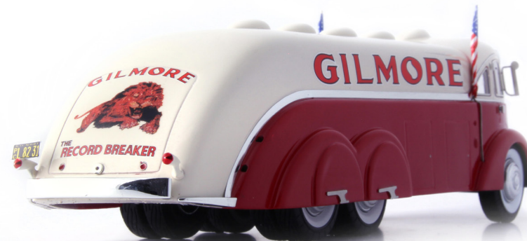
White Gilmore Streamline Tank Truck (USA, 1935) red / ivory 202 mm (scale 1/43) #11012