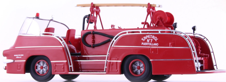
Pegaso 140 DCI Mofletes (ESP, 1959)