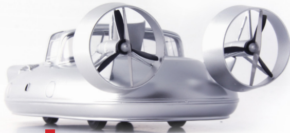
PROTOTYPES GAZ 16A (RUS, 1962) silver 170 mm (scale 1/43) #06039