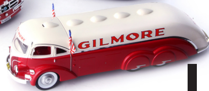
White Gilmore Streamline Tank Truck (USA, 1935) red / ivory 202 mm (1/43) #11012