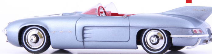
Pontiac Club de Mer (USA, 1956) light blue metallic 107 mm (scale 1/43) #06046