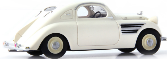
STREAMLINER Skoda Popular Special Sport (CZ, 1934) white 89 mm (scale 1/43) #04027