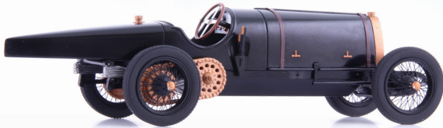
Thomas Rocket Car (USA, 1938) red 122 mm (scale 1/43) #04030