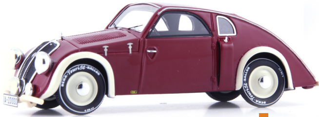
DKW GM Spezial (D, 1936) dark red / ivory 97 mm (1/43) #05032