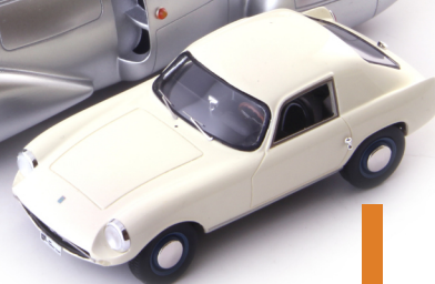
SPECIAL EDITIONS Monteverdi (MBM) Tourismo (CH, 1961) white 80 mm (scale 1/43) #05042