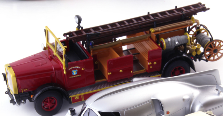
EMERGENCY VEHICLES Magirus-Maybach KS 25 "Stuttgart" (D, 1929) dark red 180 mm (scale 1/43) #12017