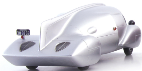
STREAMLINER Hoppe & Streur Norvell Streamliner (USA, 1946) silver 129 mm (scale 1/43) #04038